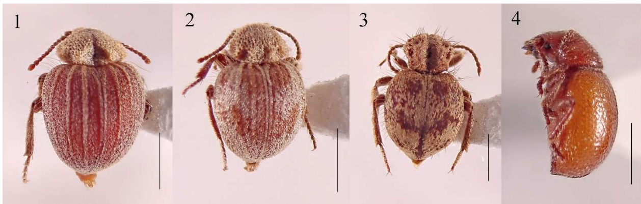
Figures 1-4. Images of spider beetle species treated in present work: 1) C. peruvianum , 2) C. pulchrum , 3) T. squalidus , 4) X. latifrons . Scale bars = 1 mm.